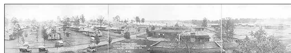
Camp Greenleaf, 1918