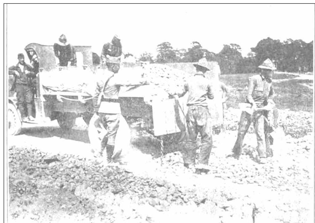
Road repair by 23 Division engineers.